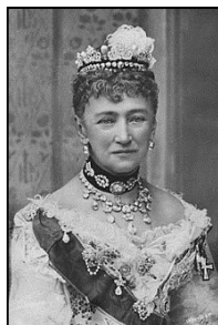
Queen Louise of Denmark

Queen Louise's Rose Garden in Bernstorff Palace Garden is a quaint rose garden which features roses grown as standards or tree roses. Queen Louise's Rose Garden was recently restored to its old glory and features 42 tree roses and a scattering of climbing roses in several varieties.